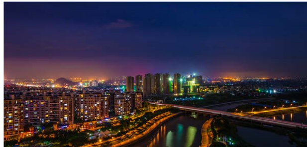
Figure 3 Famous landscape of Foshan Sanshui

strengthen the information maintenance in network publicity. In response to this change, the government strengthened the investment and level, established and improved the network assistance and investment, and promoted the network infrastructure construction in the process of Foshan cultural undertakings.