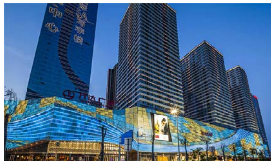
Figure 2 Urban construction of Foshan city

In the process of urbanization and modernization, we should realize the modernization of cultural facilities in Foshan and improve the related derivative products. We should integrate the developed cultural spots and perfect and reform the cultural positions which are relatively backward and lack of their own characteristics. In the process of protecting and inheriting Foshan culture, we should give up and avoid, carry forward and develop the excellent culture, give up the culture with limitation and backwardness, guarantee to show the excellent part of culture in front of people in the new era, and realize the culture in the new era with the help of advanced technology and equipment of multimedia informatization Second development. In the process of cultural development, we should start from the overall situation, set an example of cultural regions, improve cultural facilities, enhance the development of cultural characteristics, combine traditional culture with modern cultural facilities, and promote culture into a sound development path.